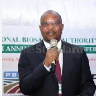
Kenya set to approve three GM crops for commercialization