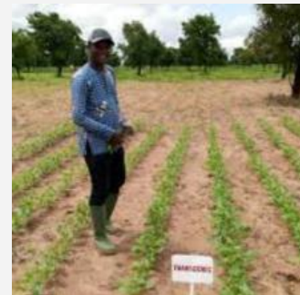
Ghanaian Court Dismisses Suit Challenging GM Products