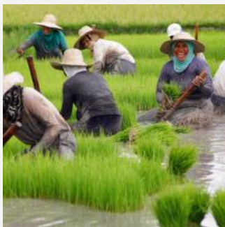
Transitioning the world's largest rice genebank into an AI-powered next-gen genebank