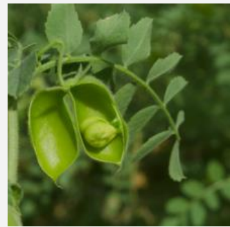
Wild Species Provide Insights into Improving Chickpeas