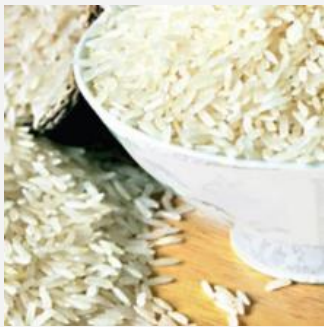
New ICAR basmati rice varieties