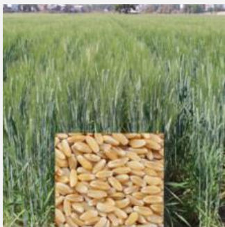
PAU's new wheat variety, PBW Biscuit-1 to encourage food processing industry