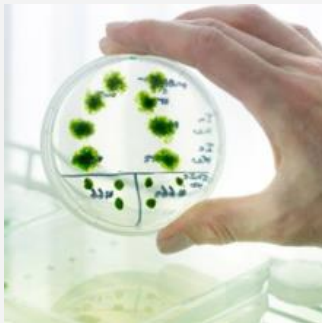
Plant Genetics as a Tool for Manipulating Crop Microbiomes: Opportunities and Challenges