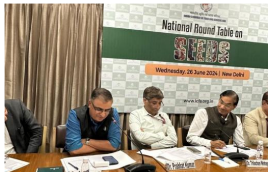
FSII at the National Round Table Conference on Seeds by Indian Chamber of Food and Agriculture