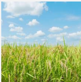
Indian experts Review Gene Editing Applications in Rice