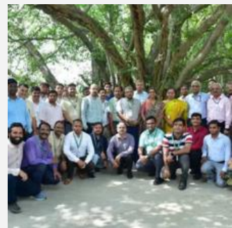
Warmer temperatures are likely to reduce yields of major crops