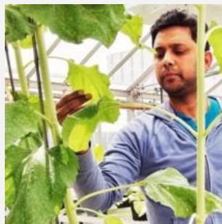
Scientists are on a quest for drought-resistant wheat, agriculture's 'Holy Grail'