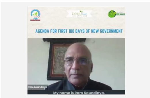
Agenda for First 100 Days of New Government – Ram Kaundinya