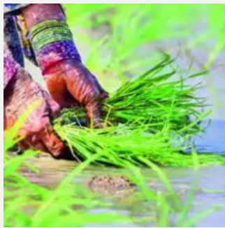
PAU to join hands with IRRI to develop dwarf rice varieties