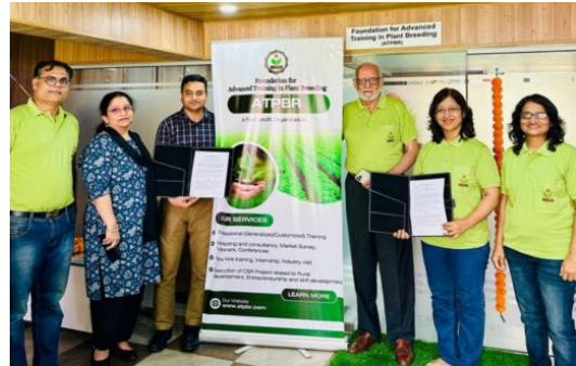
FSII signed MOU with The Foundation for Advanced Training in Plant Breeding (ATPBR)